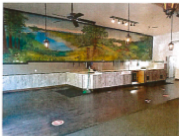
Building Photos (3 photos)