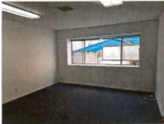
Building Photos (4 photos)

Quiet office in a locked building 1 block from the U.C Berkeley South Campus